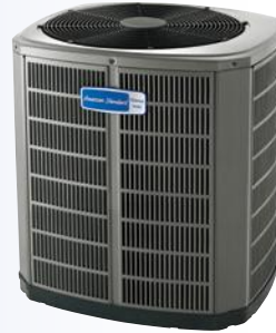
AccuComfort™ Platinum 18