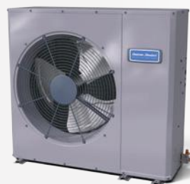
Silver 16 Low Profile