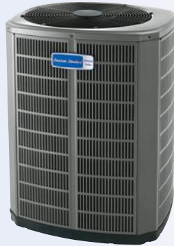
AccuComfort™ Platinum 20

American Standard Platinum air conditioners offer our highest combination of performance, efficiency, and temperature control. Built with American Standard's commitment to quality throughout, the Platinum line offers advanced energy-saving features like Duration™ variable speed compressors and Spine Fin™ coils.